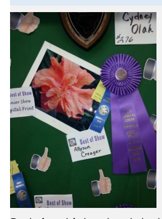
Parkview high school student wins at the Sandwich fair!