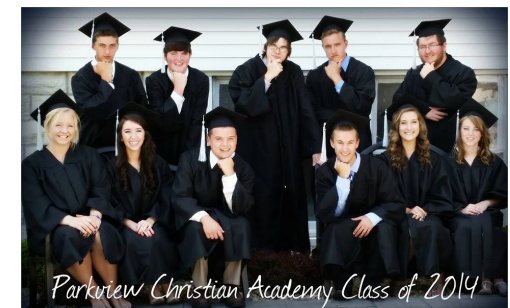
Parkview Christian Academy Class of 2014

A school improvement plan (SIP) will be written based on recommendations from the accreditation report. The SIP will be submitted for review each year in order to maintain accreditation status.